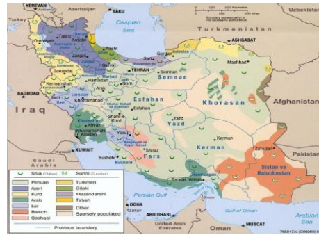
(Map source here )

Known as Persia until 1935, Iran became an Islamic republic in 1979 after the monarchy was overthrown and Shah Mohammad Reza Pahlavi was forced into exile. Shia Muslim Islamist clerical forces led by Ayatollah Ruhollah Khomeini established a theocratic system of government with political authority vested in a religious scholar referred to as the Supreme Leader who is accountable only to the Assembly of Experts - an elected 86-member body of clerics. Now the Supreme Leader is the Ayatollah Ali Khamenei. Iran's current President is Hassan Rouhani. The President is elected in an undemocratic process every four years.